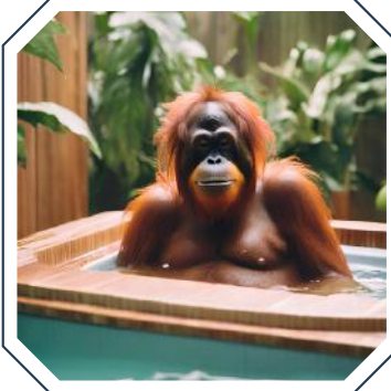
Orangutan in hot tub