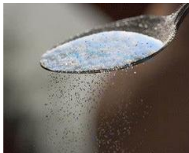
Enough Fun dip® to kill a Carebara atoma ant