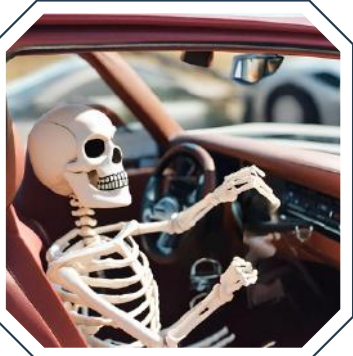
Skeleton pulled over for DUI!