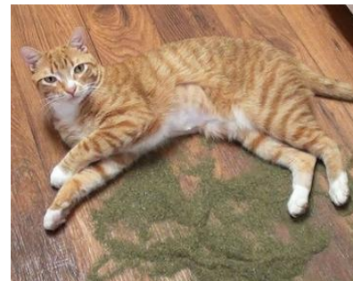
Dangerous amount of Gato Ganga