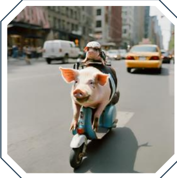
Pigs on a joyride